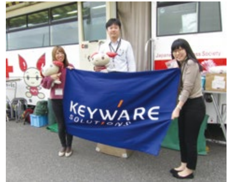
Blood donation activities

From fiscal 2018, our Company has cooperated with blood donation activities of the Japanese Red Cross Society as a part of our CSR activities. Every December, we conduct blood donations at our main offices because it is more difficult for the organization to secure donations during the winter. In fiscal 2019, 56 people donated blood, surpassing the previous year. In response, the Tokyo City Red Cross Blood Center expressed their thanks to our company. We plan to continue contributing to society through blood donation activities in the future.