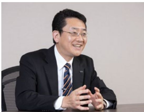
Director and Corporate Officer in charge of Corporate Staff

Furthermore, we have enhanced our training system by enacting training sessions