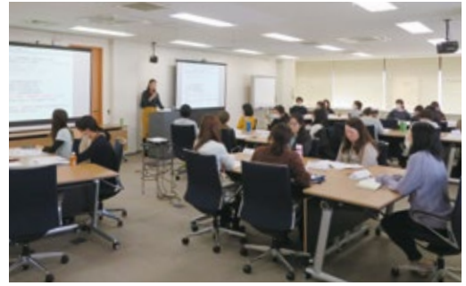
Female Advancement Promotion Seminar

is currently female; however, this number rises each year, with approximately half of the hires of new graduates being women in fiscal 2020. As workstyle continues to become more diverse, we are conducting “Female Advancement Promotion Seminars” which delve into the topic of career shape. As a measure to support employees with small children, we have expanded the period employees can take childcare shortened work hours from the month the child enters elementary school to the end of the child’s third year in elementary school. In 2019, we received certification as a “Childcare Support Company” from the Ministry of Health, Labor and Welfare and acquired the “Kurumin” certification mark.